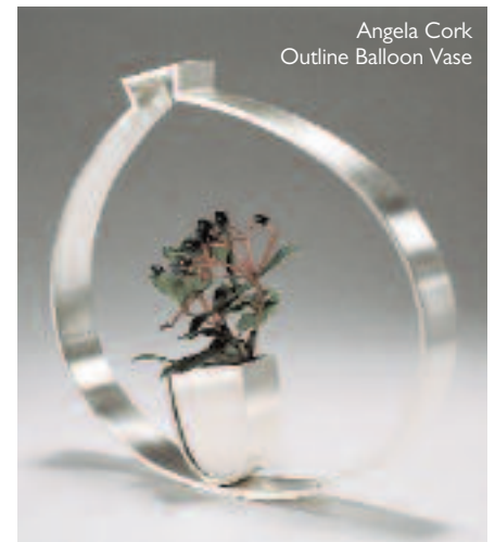
Angela Cork Outline Balloon Vase

Leaflets showing the work of those who exhibited together with their contact details are available on request from the BJA at 0121 237 1108.